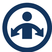
Connections & Relationships

The College's strategic journey over this period is undergirded by five foundation pillars which support our learning community. These foundation pillars honour the work of the College's pioneers and equip the College to reinvigorate learning for the next generation. The process of reflecting on achievements and looking forward to future innovations, will be integrated with these five foundation pillars.