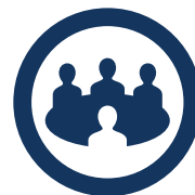
Leadership & Governance

On the following pages, each of the five foundation pillars will be explored from the dual perspectives of identifying strategic actions that have been achieved, and articulating actions that will be focused on for the next three years. This provides an opportunity for our learning community to celebrate our achievements during the Construction Phase and outlines in greater details the strategic preparations for the Extension Phase.