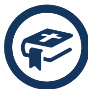
Our Christian Identity